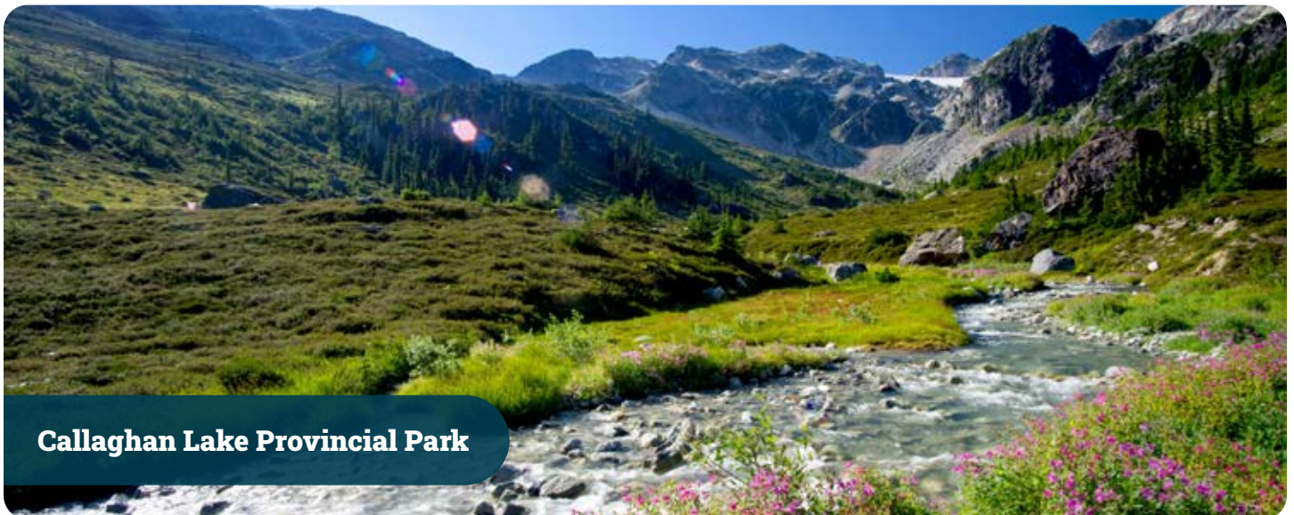
Callaghan Lake Provincial Park

If you have any difficulty reserving a room at your preferred hotel, the type of room you want, or additional nights, we can usually help – email us at info@fnrel.org .